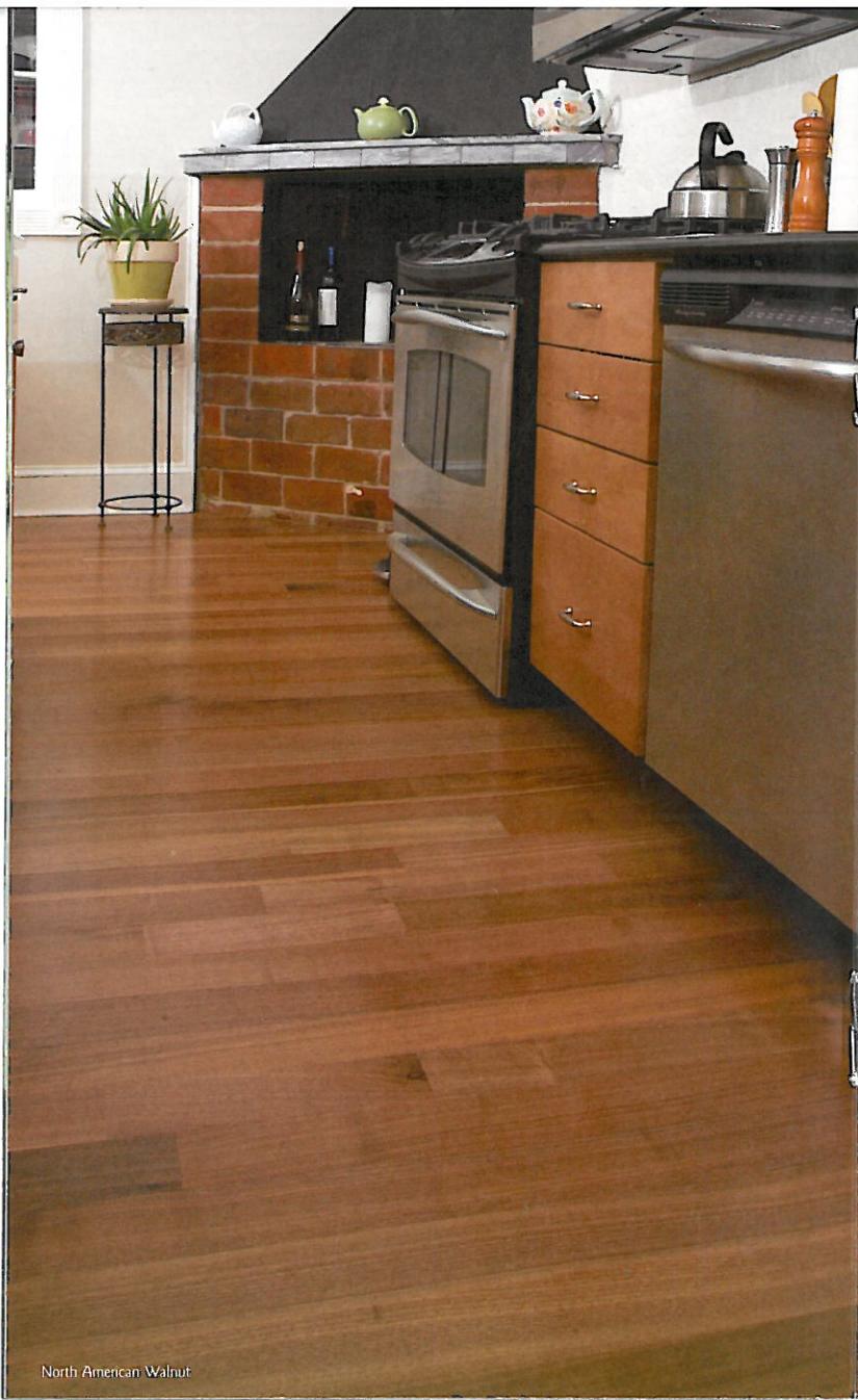
North American Walnut