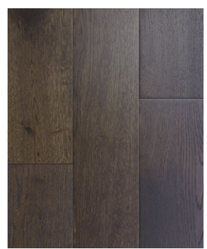
TURKISH COFFEE DMMF-1808