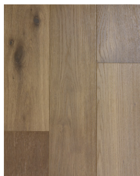
TAUPE GREY DMMF-1803