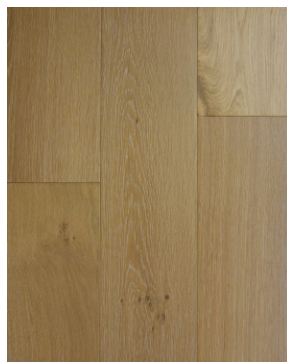
PALE TAN DMMF-1802