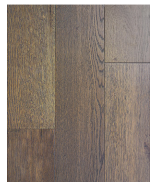
HONEY TOPAZ DMMF-1804