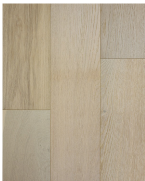
VINTAGE WHITE DMMF-1801